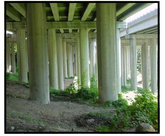
Open space under Interstate 5 proposed for redevelopment.

Cindi Barker - (425) 266-2533, cbarker@qwest.net Lisa Merki - (206) 914-9439, lmerki@earthlink.net