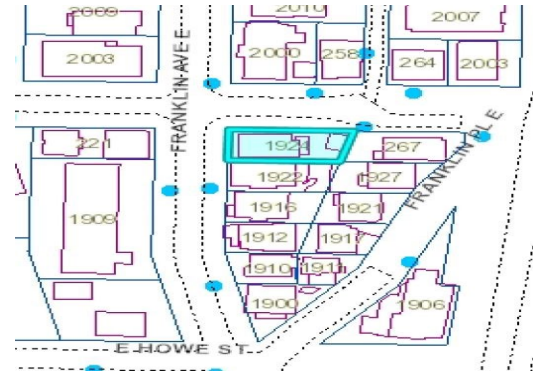
The top of this image is north. This map is for illustrative purposes only. In the event of omissions, errors or differences, the documents in Seattle DCI's files will control.

Your written comments are encouraged and should be submitted to: