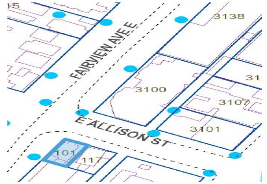
The top of this image is north. This map is for illustrative purposes only. In the event of omissions, errors or differences, the documents in Seattle DCI's files will control.

Shoreline Substantial Development application to allow a 3-story, 3-unit apartment building with retail. No parking provided. Existing building to be demolished.