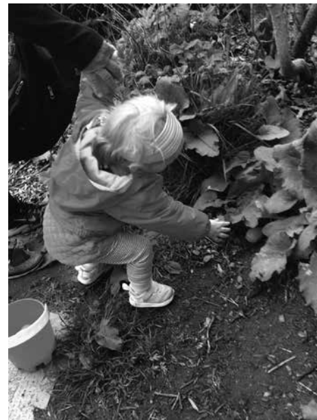
Top and right: other photos capturing the day.