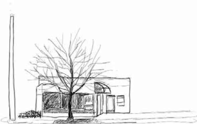
Before was Aloha Cleaners and adjacent parking.