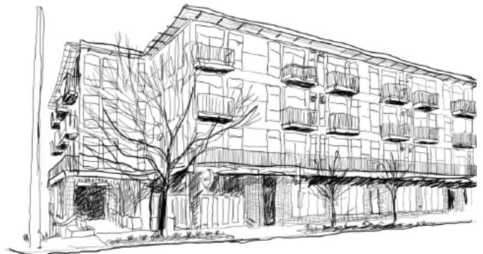
After, the Waterton Apartments; Aloha Cleaners relocated to the new building's north end.