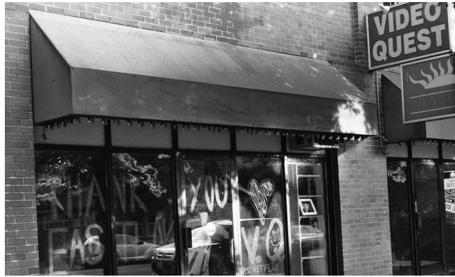
A big “Thank you Eastlake! V.Q.” is painted on the windows of the recently-closed Video Quest.

Local businesses are a big part of what many value about Eastlake, and are often featured in this column. We rarely write about closures, but two recent ones hit us hard, reminders not to forget the many businesses that are no longer with us. Video Quest gave way to changes in the industry, and nicely marked its 20-