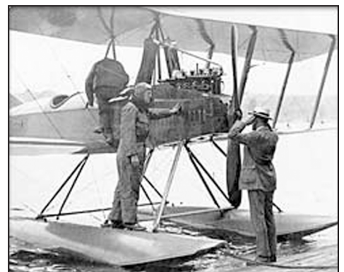
William Boeing, in his usual flight overalls, with his own Model C next to the ramp of the Lake Union hangar at the foot of Roanoke Street. His plane was the last one built and identical to the Navy's down to its military paint scheme. Although Boeing flew often in the plane, he flew with an experienced pilot (not seen in picture).