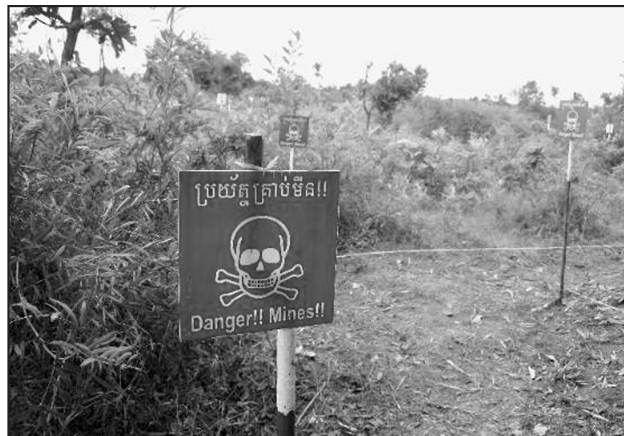
Many village areas in Cambodia are littered with landmines