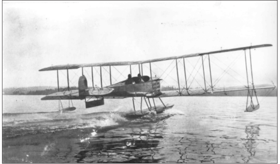
Flying from Lake Washington in late 1915 and before the Lake Union hangar was built, William Boeing used a Martin TA trainer to drop cardboard "bombs" on bemused Seattlites.

The Aero Club's politics were apparent from the many military officers among its initial 19 members, including the commandant of the Puget Sound Navy district. All the members were close acquaintances of Boeing. Some belonged to the exclusive University Club (of which he was a member), or were tenants in the downtown Hoge Building along with him, or fellow lumber men, or simply friends like the four women who