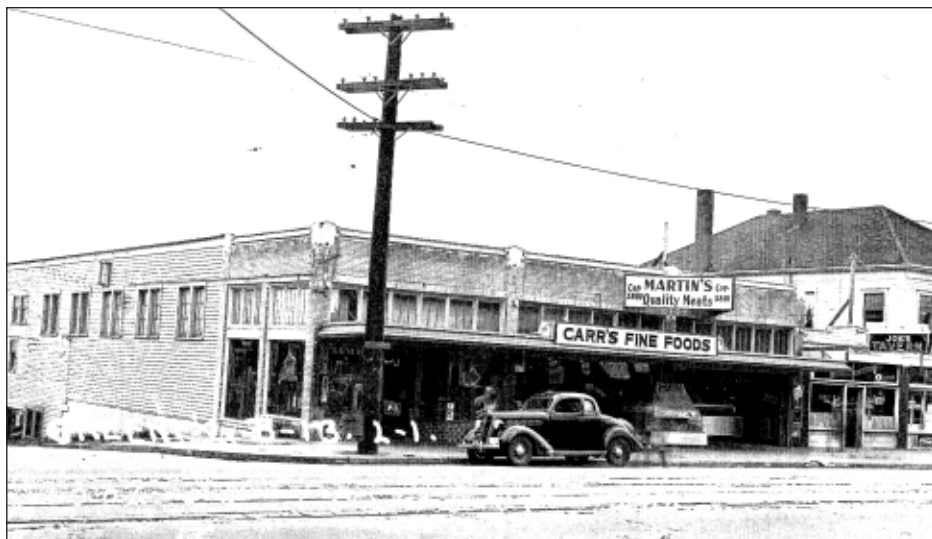
The Hines Public Market building, current home of the Eastlake Zoo Tavern, was once Eastlake's version of Pike Place. The building's owners and the successful businesses it houses deserve credit for preserving it as one of Eastlake's best-loved destinations.