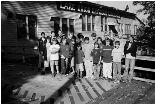
Since 1996, Lake Union Drydock has hosted a Fairview Avenue E. cleanup by Boy Scout Troop 171, which is sponsored by Assumption Catholic Church. At this year's Oct. 22 work party, the Scouts not only picked up a huge amount of trash, but removed invasive plants for the shoreline restoration project.