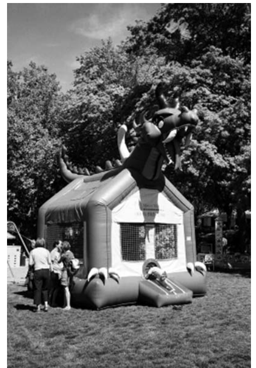
For LakeFest, ECC rented this "bouncy dragon," which was a hit with kids and parents alike.