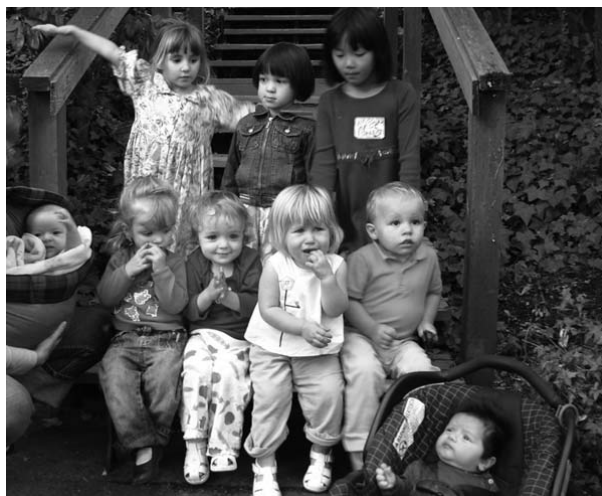
Some of the kids now living in the Tenas Chuck houseboats at 2331 and 2339 Fairview.