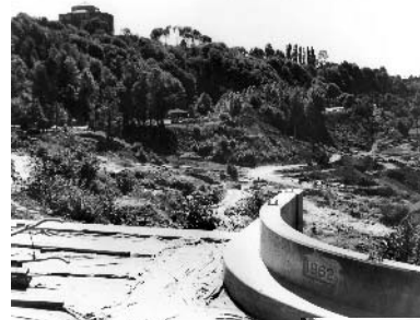
Peaceable valley: Eastlake's southern edge before it was devastated by Interstate 5.