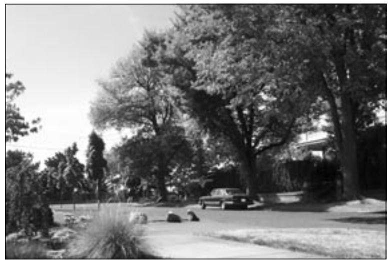
E Edgar St, looking towards I-5. Street-Tree-Program Norway Maples backed up by Roanoke Elms A, B, and C.

Elm is the predominate large tree in the Roanoke neighborhood. With the cooperation of multiple elms owners, the Seattle Parks Department, and the City Arborist's Office, Roanoke residents have organized to manage the risk of Dutch elm disease to their neighborhood defining trees, establishing an elms fund to help pay for monitoring and for prophylactic pruning and injections.